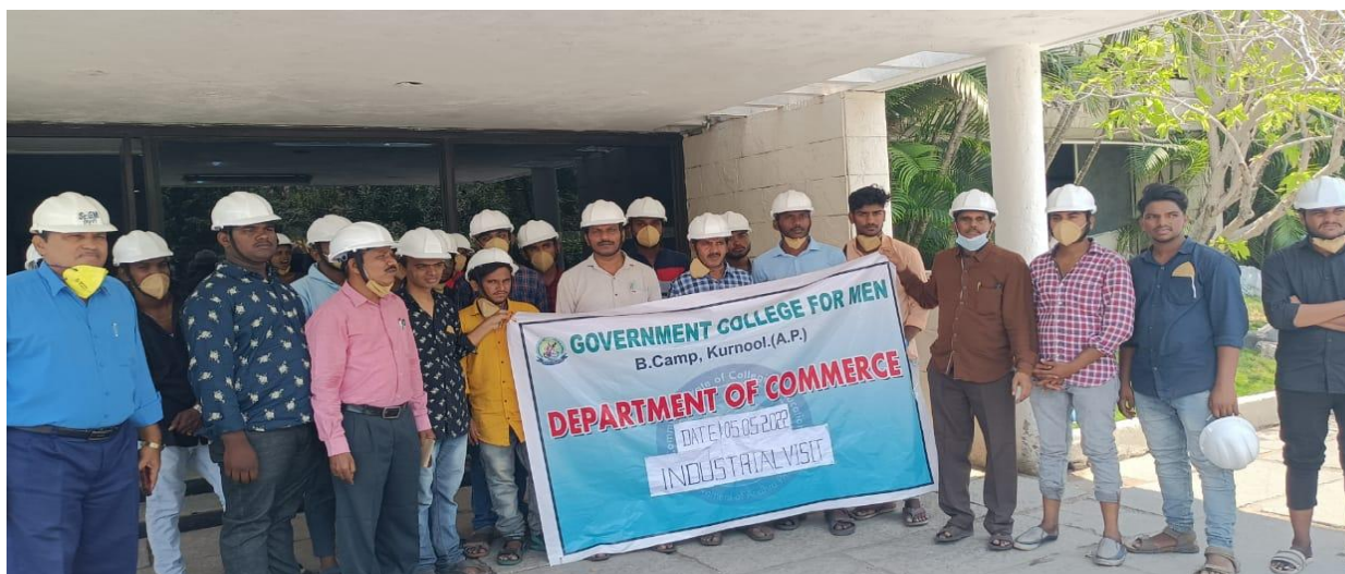
5.5.2022: Today visited TGV Group of Companies and Sunkesula Dam as a part of Industrial/Educational tour organised by Department of Commerce for Final B Com Students.