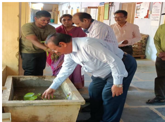
Lotus plantation by Honorable VC sir and Registrar sir ,Cluster University in our college premises. On 2.5.2022